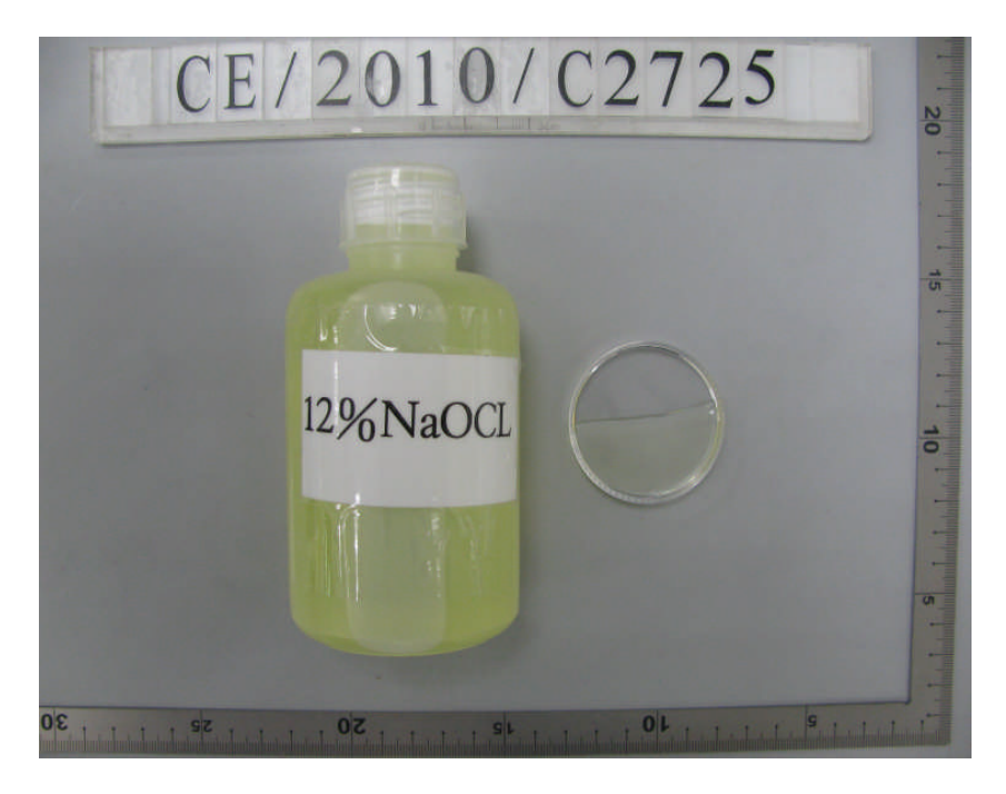
** 報告結尾 (End of Report) **

NO. 377, HAIHU EAST ROAD, HAIHU VILLAGE, LUCHU HSIANG, TAOYUAN HSIEN, TAIWAN